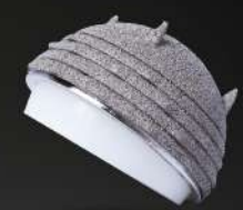
DUAL MOBILITY SYSTEM

bioradmedisys™ bioradmedisys.com Biorad Medisys Pvt. Ltd.