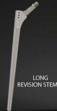
LONG REVISION STEM